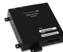
Connected IO ER1000

Ultracompact, EM1000 features a high-speed multiband cellular modem encased in an innovative lightweight slimline enclosure.